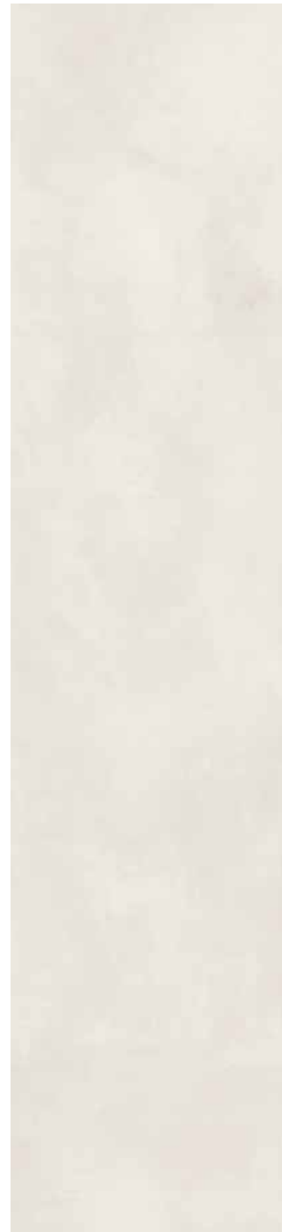
HPA 10 Rett. 40x180 cm 16x71 in 156