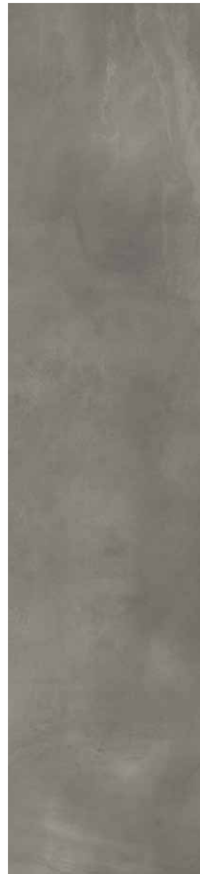
HPA 8 Rett. 40x180 cm 16x71 in 156