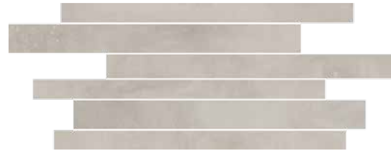
Muretto / HPA 5 30x60 cm 12x24 in 293