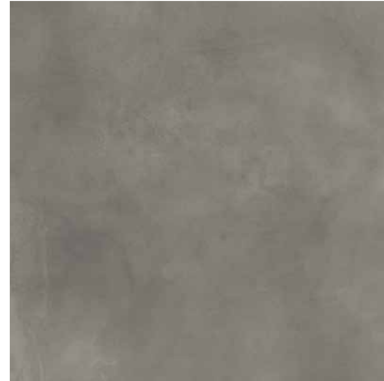
HPA 8 Rett. 80x80 cm 32x32 in 101