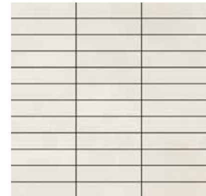
Mosaico / HPA 10 40x40 cm 16x16 in 293