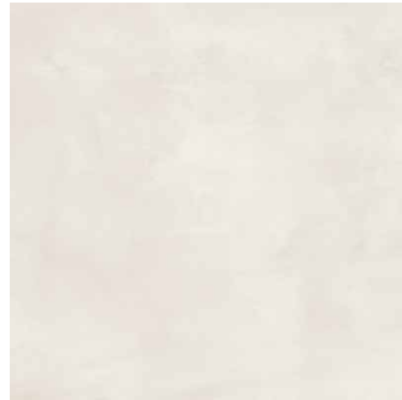
HPA 10 Rett. 80x80 cm 32x32 in 101