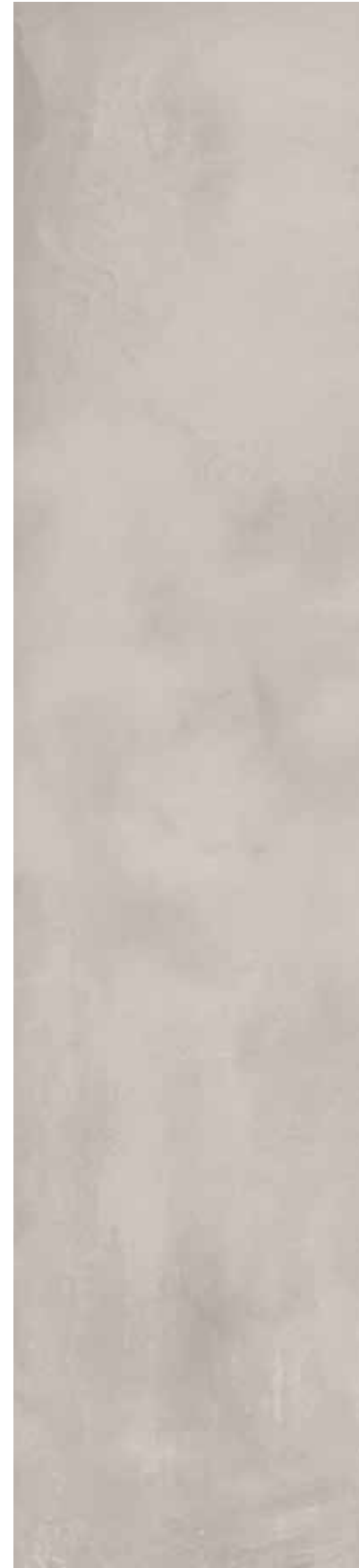
HPA 5 Rett. 40x180 cm 16x71 in 156