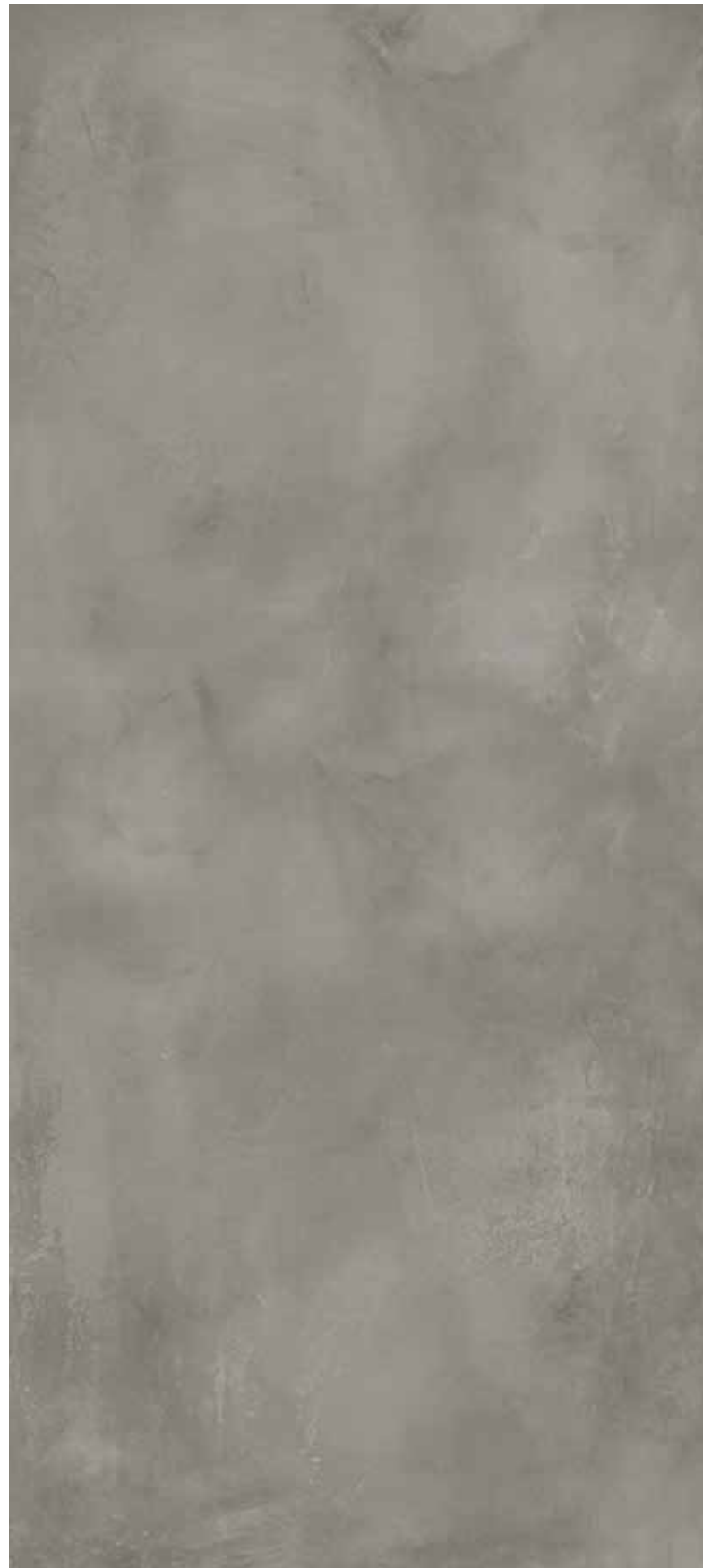
HPA 8 Rett. 80x180 cm 32x71 in 156