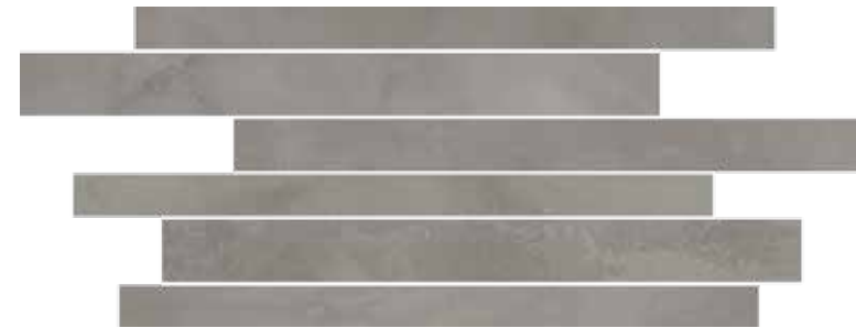
Muretto / HPA 8 30x60 cm 12x24 in 293