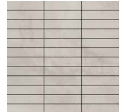
Mosaico / HPA 5 40x40 cm 16x16 in 293