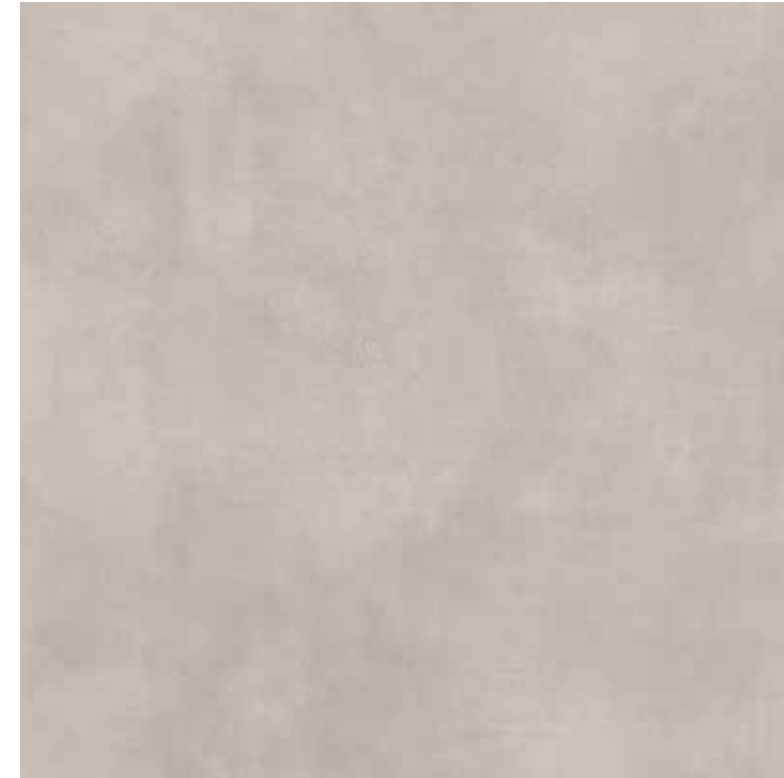
HPA 5 Rett. 80x80 cm 32x32 in 101