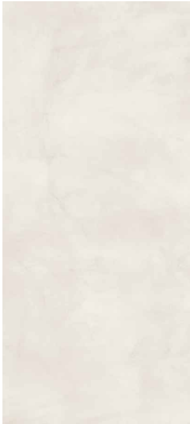
HPA 10 Rett. 80x180 cm 32x71 in 156