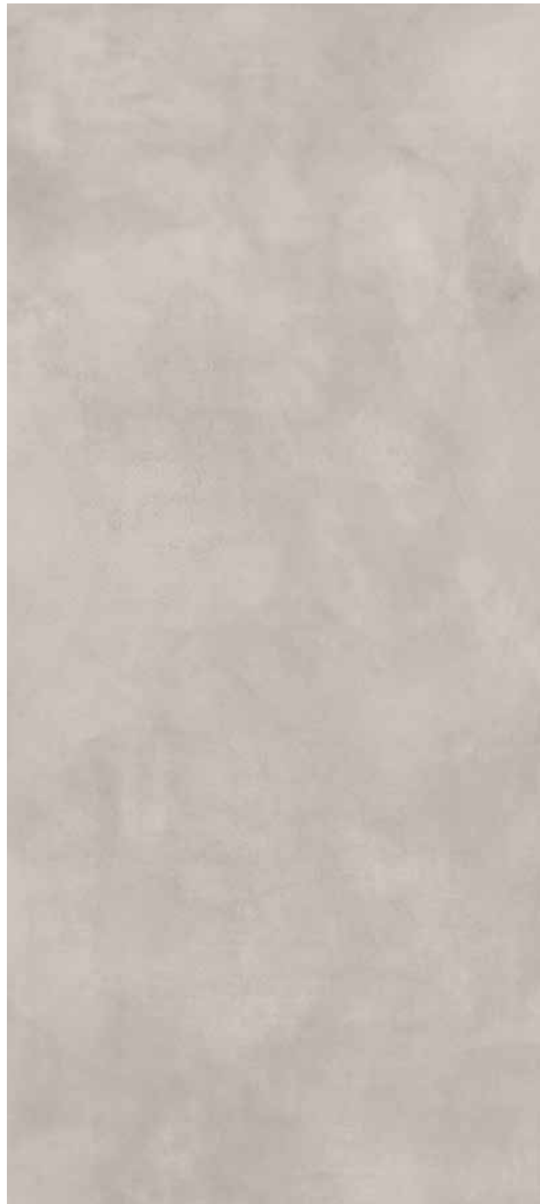
HPA 5 Rett. 80x180 cm 32x71 in 156