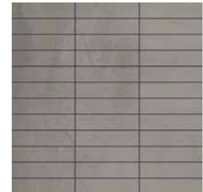
Mosaico / HPA 8 40x40 cm 16x16 in 293